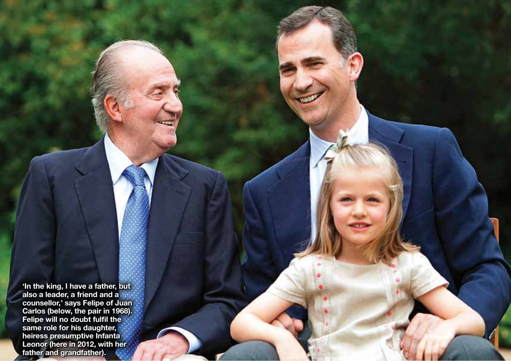
'In the king, I have a father, but also a leader, a friend and a counsellor,' says Felipe of Juan Carlos (below, the pair in 1968). Felipe will no doubt fulfil the same role for his daughter, heiress presumptive Infanta Leonor (here in 2012, with her father and grandfather).